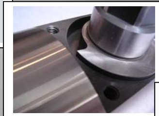
Tools and flanges for extruders.

This company offers first class products and turnkey solutions according to quality standards in the field of extrusion.